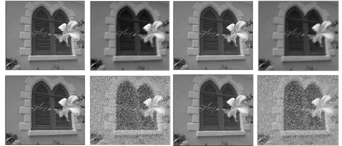
Fig. 3. “Window” image. Left quadruple – no-noise experiment. Right quadruple – noise experiment

the motion kernel. In one experiment random noise presented (PSNR= 23.56 dB), while in the other white noise with STD \sigma = 5 was added (PSNR= 23.19 dB). Then, 30% of pixels were randomly removed. This reduces the PSNR to 10.22 dB and 10.20 dB, respectively. We compared the restoration results with the respective results reported in [8]. In the no-noise experiment the PSNR of the image restored by the semi-tight frame described in Example 2 was 43.78 dB versus 40.25 dB in [8]. For the noise experiment the PSNR was 28.81 dB versus 27. 76 dB in [8]. The restoration results are displayed in Fig. 3.