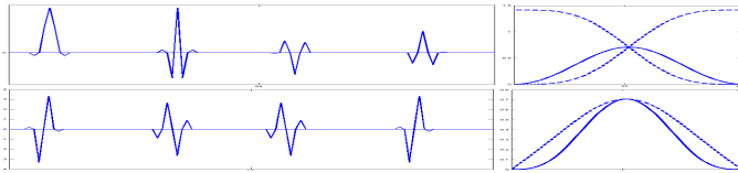
Fig. 1. Top:FB generating tight frames: impulse and magnitude responses derived from quadratic quasi-interpolating spline. Bottom: analysis and synthesis band-pass filters for semi-tight frame

The high-frequency framelet \psi^1 has four LDVM. We assign three LDVM to the analysis framelet \tilde{\psi}^2 leaving only one LDVM to the synthesis framelet \psi^2 and vice versa for the framelets \tilde{\psi}^3 and \psi^3 . Figure 1 displays impulse and magnitude responses of the p-filters derived from quadratic quasi-interpolating spline, which generate the tight and the semi-tight frames. We observe that the impulse responses of the band-pass p-filters for the tight frame are non-symmetric. The semi-tight frame band-pass p-filters have anti-symmetric impulse responses.