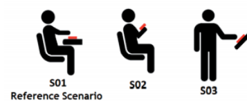
Figure 2. Scenarios tested in the experiment [14].

Later on, the same authors in [14] carried out another usability and accessibility evaluation of DSV. 21 participants joined the assessment and were asked to sign on an iPad. The experiment was split in three different sessions (one week apart), and three different scenarios were tested (Figure 2).