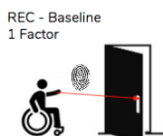
Figure 3. Scenario under Reference Evaluation Condition (REC).

In the baseline scenario, a user arrives at the door point and present her finger to a biometric sensor embedded on the door lock (Figure 3).