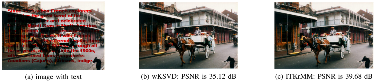
Fig. 1: Inpainting example: Text removal