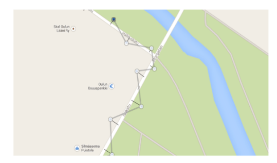
Fig. 6: Path of the GPS location updates with closest-to-road vectors.

GPS data inaccuracies are eliminated by calculating the closest possible location for avatar on top of the road, which effectively disallows the avatar to be located inside buildings or other structures (Figure 6). This is crucial because city venue contains lots of tall buildings and running on the sidewalk close to these buildings causes GPS sensor to have multipath issues.