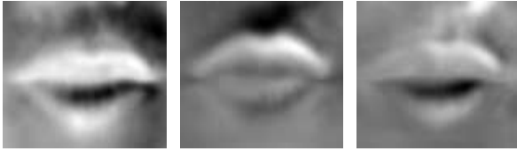
Figure 1: The first three principal components from the Tulips1 database.

a set of N image training examples \mathbf{x}_1, \dots, \mathbf{x}_N , each image is considered as a d dimensional feature vector ( d equals the number of pixels in an image).