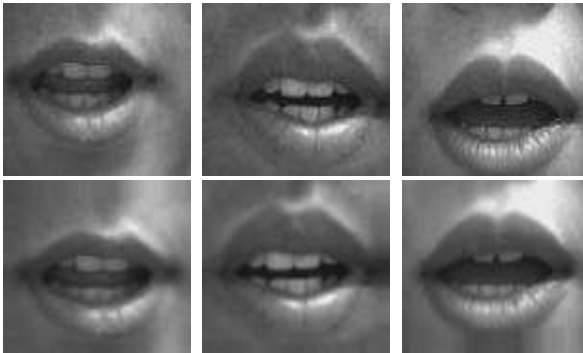
Figure 3: Lip image examples from the Tulips1 database, [13]. Upper row : Original lip images. Lower row : Corresponding normalized lip images.

projection coefficients are chosen due to the maximum eigenvalues, these projections can be viewed as mutual information eigenlips . The first three mutual information principal components are shown in Figure 2. If we compare these images to those shown in Figure 1, it can be seen that MI principal components emphasize the lip shapes (edges) and discard the lighting directions.