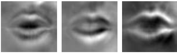
Figure 2: The first three mutual information principal components from the Tulips1 database.