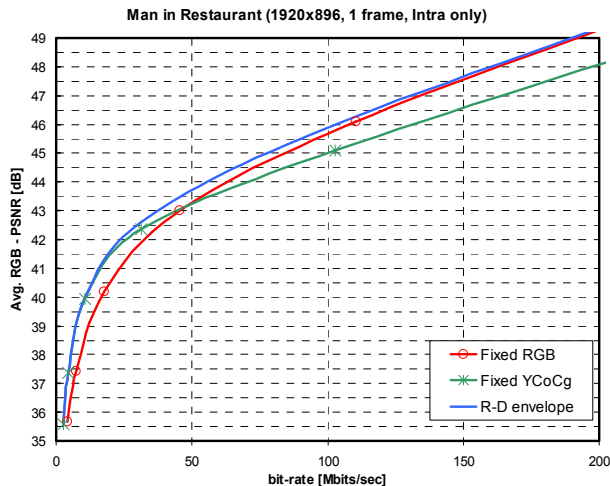
Fig. 1 - R-D curves for encoding a single picture of a film-scanned test sequence in two fixed color space representations together with the corresponding R-D envelope (in blue, partly covering the R-D curves for RGB and YCoCg ). Note that the distortion D is measured as the mean of R , G , and B PSNR values.

noise across the RGB components (as it is, e.g., often the case for film-scanned video sources).