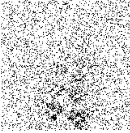
Figure 2: Noisy Observation of Fractal Leaves

Thus, we have generic representation of the self-similarity on noisy discrete imagery as follows: