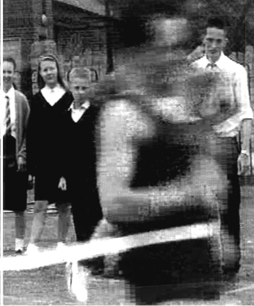
Fig. 1 Section of a single frame from the sequence Exam Conditions, MPEG2 coded at 2Mbit/s