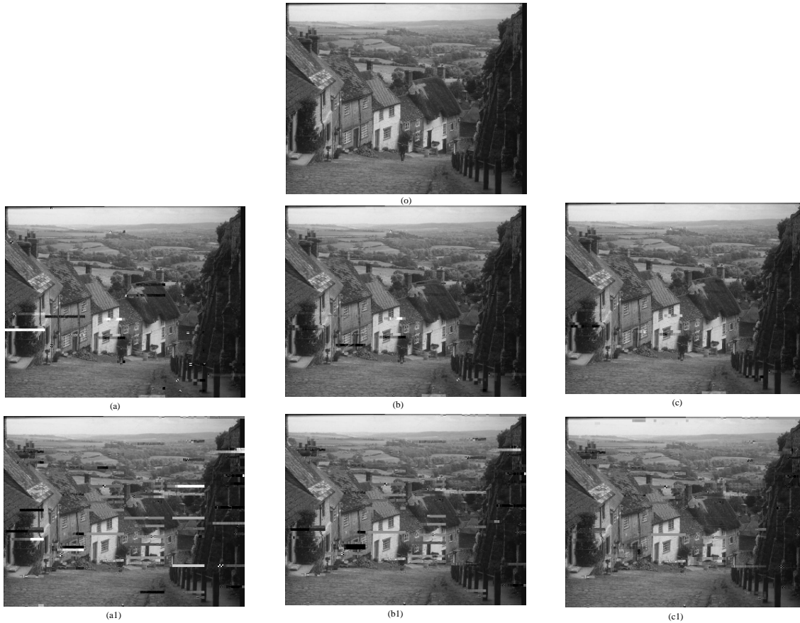
Figure 3: "Gold Hill" decoded image by the robust and conventional JPEG decoders with a 15MCU/RST interval length and under a BER of 0.2 \cdot 10^{-3} (o) : Error free decoded image. (a) : Conventional Baseline process, PSNR=25.50dB. (b) : Robust Baseline process with prediction neighbourhood, PSNR=29.94dB. (c) : Robust Baseline process with interpolation neighbourhood, PSNR=31.15dB. (a1) : Conventional extended process, PSNR=21.09dB. (b1) : Robust extended process with prediction neighbourhood, PSNR=23.75dB. (c1) : Robust extended process with interpolation neighbourhood, PSNR=26.29dB